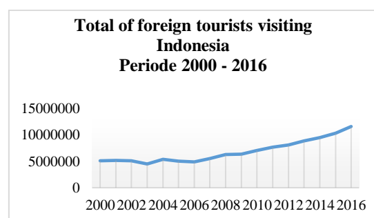
Figure 1 Total of foreign tourists visiting Indonesia Periode 2000 - 2016

At this time, many people are busy with their work routines, it is because of the factor demands economic needs. Therefore, many families who perform quality / family time during long holidays by doing a vacation or traveling to several destinations. Traveling is something that is important to reduce the impact of stress from the pressure of work and the burden of the mind. Therefore, do not be surprised if someone went to visit tourist destinations at domestic home or abroad and spend a lot of money to spend time vacationing with family.